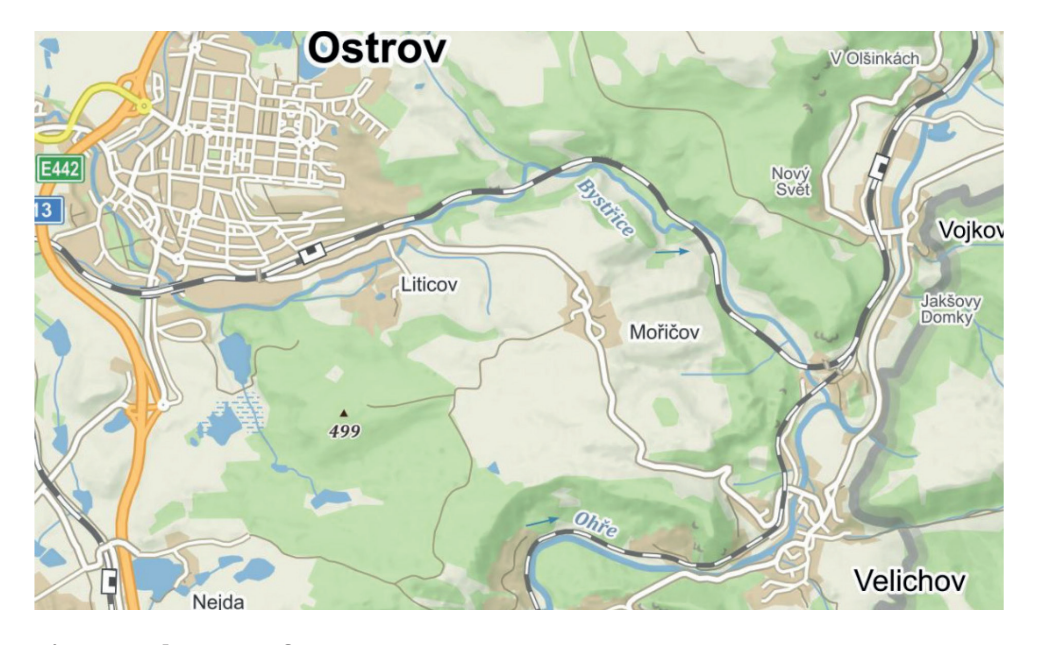
Figure 1. The town of Ostrov

In other cases, the municipality name has been complemented by an attribute referring to the location on a river, for example, Slapy nad Vltavou 'upon the river Vltava' or Černožice nad Labem 'upon the river Elbe'. Again, one extreme case can be mentioned, namely Ostrov nad Ohří . In fact, the town is located not on the Ohře, but on a different smaller and less important river called Bystřice (a tributary of the Ohře). The river Ohře is several kilometres away from the town (see Figure 1).