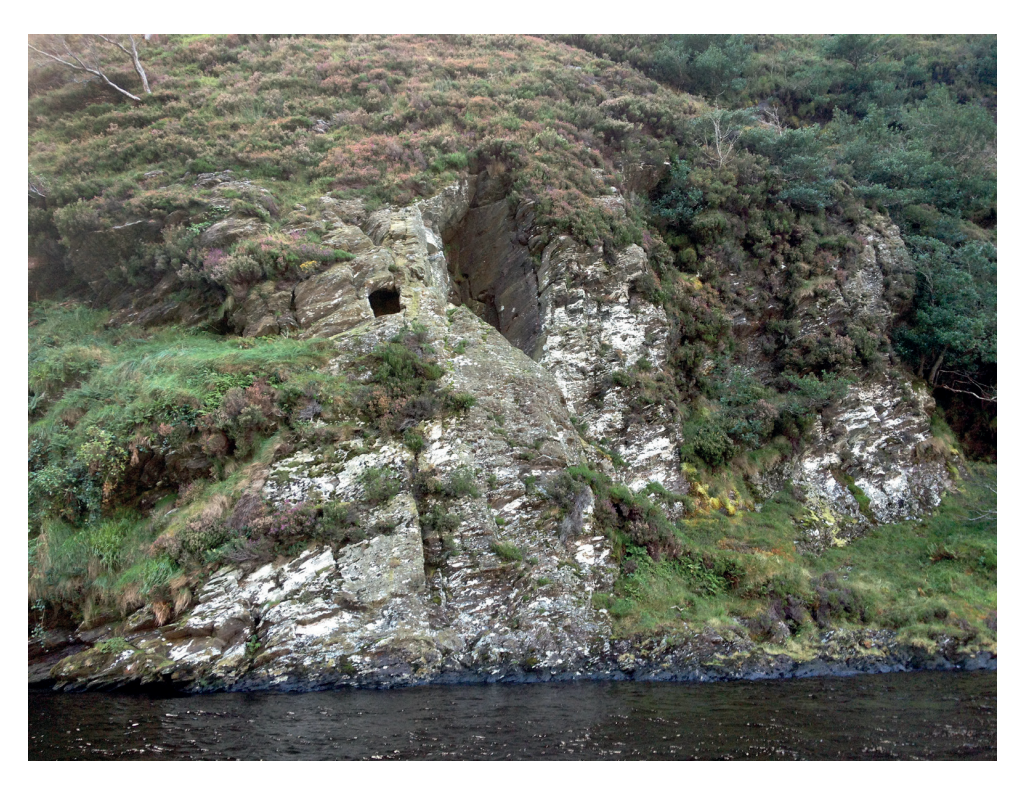
Figure 4. Leaba Chaoimhín/St. Kevin's Bed (cave), Glendalough, Co. Wicklow