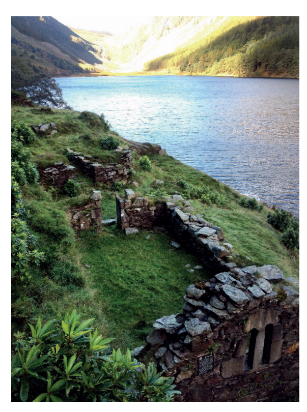
Figure 2. Teampall na Sceilge/Templenaskellig (12th c.), Glendalough, Co. Wicklow