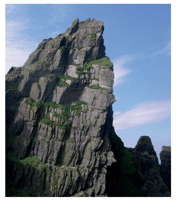
Figure 1. The south peak of Sceilg Mhichíl/Skellig Michael, Co. Kerry. 9th century hermitage/oratory on ledge near summit

Glendalough, an important early Irish monastery in Co. Wicklow famed for its setting in the 'valley of the two lakes'. The settlement was originally eremitical, founded by St Kevin in the sixth century. A large monastery grew up around the cult of the saint, and in 1111 Glendalough was made the seat of a bishopric. (...) The original hermitage was probably sited on the hillside above the upper lake where a small oratory, Tempall-na-Skellig, now stands. (Moss, 2002b, p. 525)