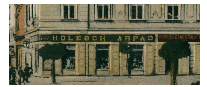
Figure 12. Sign before 1918: Holesch Arpád