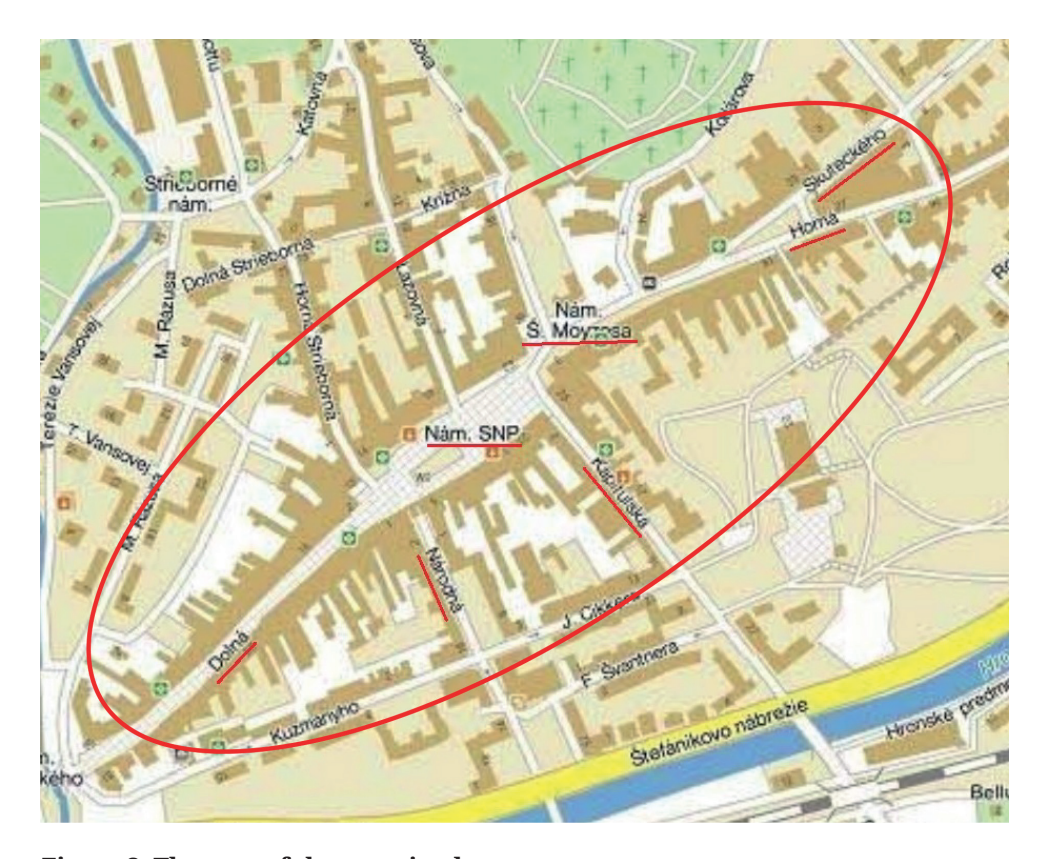
Figure 2. The map of the examined area

of ideological pressure of the ruling authorities (as explained above) on people moving in the social space. David and Mácha (2012) define it as domination of the territory and the formation of a centralized state administration (p. 30). Urbanonyms (especially commemorative urbanonyms) are among the toponyms that change most dynamically with the change of political regimes (e.g., Odaloš, 1994, 1996; David & Mácha, 2012; Křížová & Martínek, 2017; Ptáčníková, 2019, 2021). Rapid changes in this part of the LL can be demonstrated on the example of changes in the names of streets and squares of the historic centre of BB in the observed period of the 20th century – five streets and or two squares – see Figures 1 and 2.