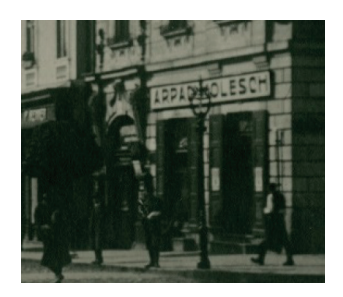
Figure 13. Sign after 1918: Arpád Holesch