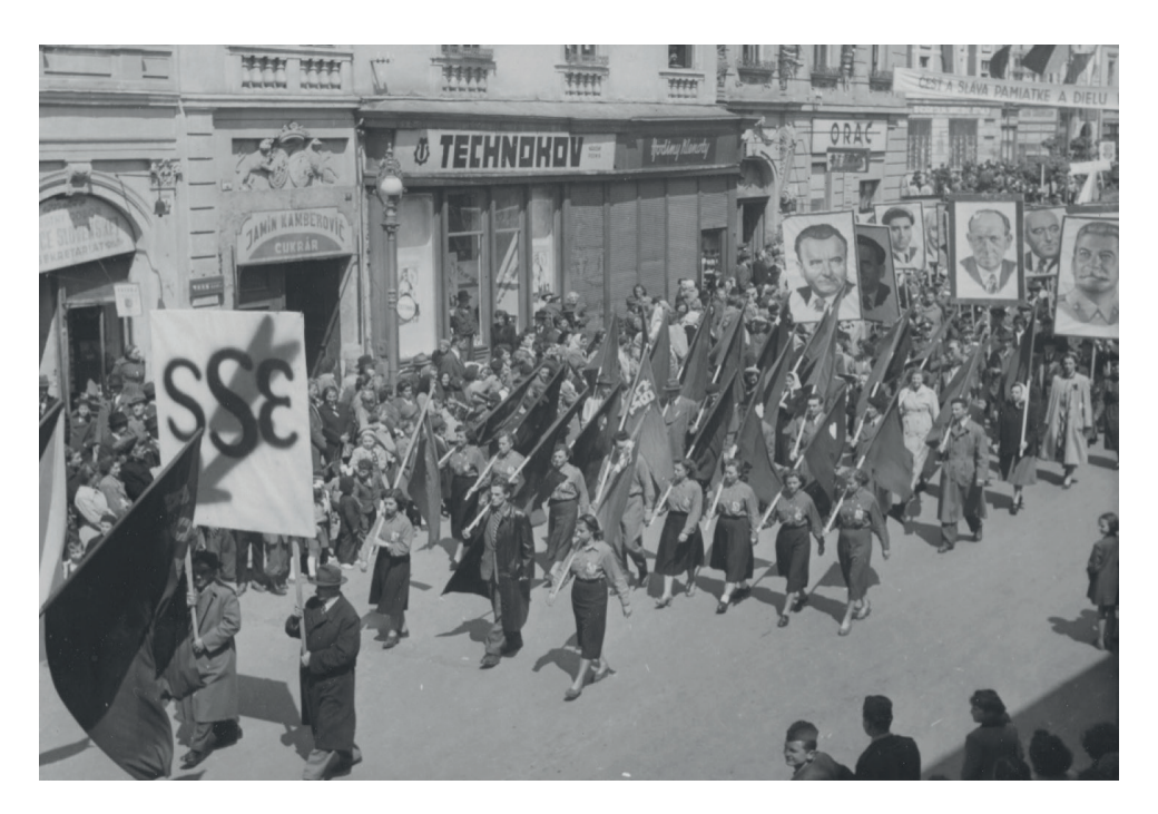
Figure 15. Signs after 1945

The third milestone was the political coup in 1948 – the establishment of the communist dictatorship which meant censorship, a ban on private farming, ideological inscriptions, slogans and banners (see Figure 15 and 16):