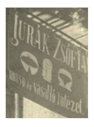
Figure 6. Female name